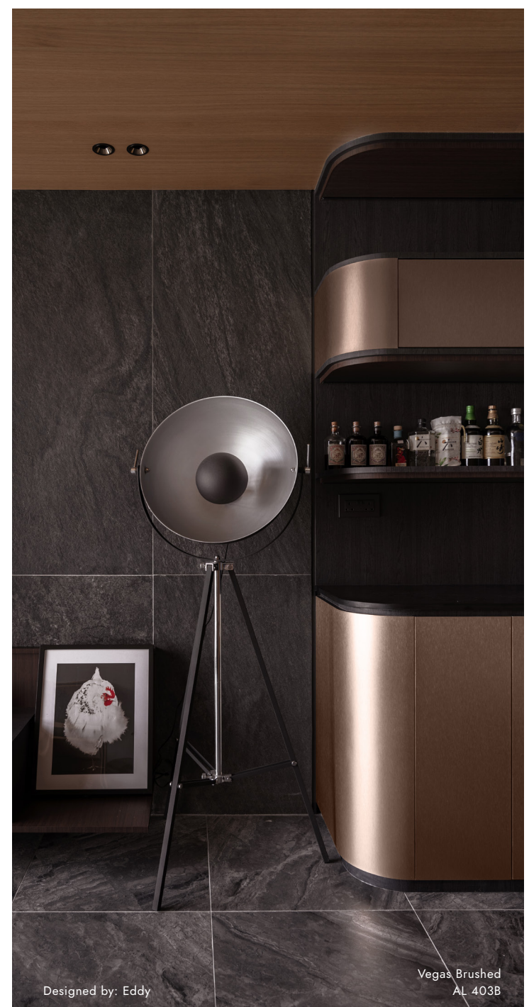
Designed by: Eddy