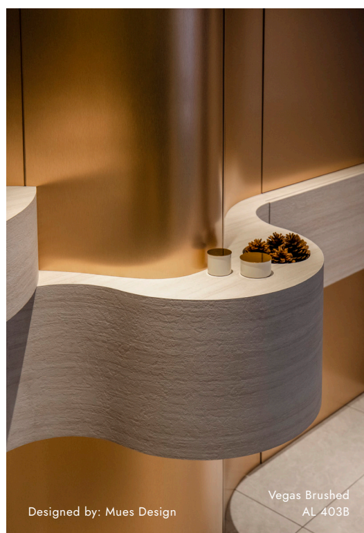
Designed by: Mues Design