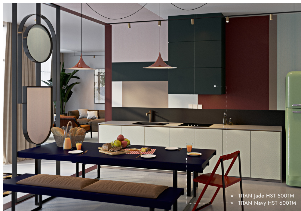
• TITAN Jade HST 5001M • TITAN Navy HST 6001M