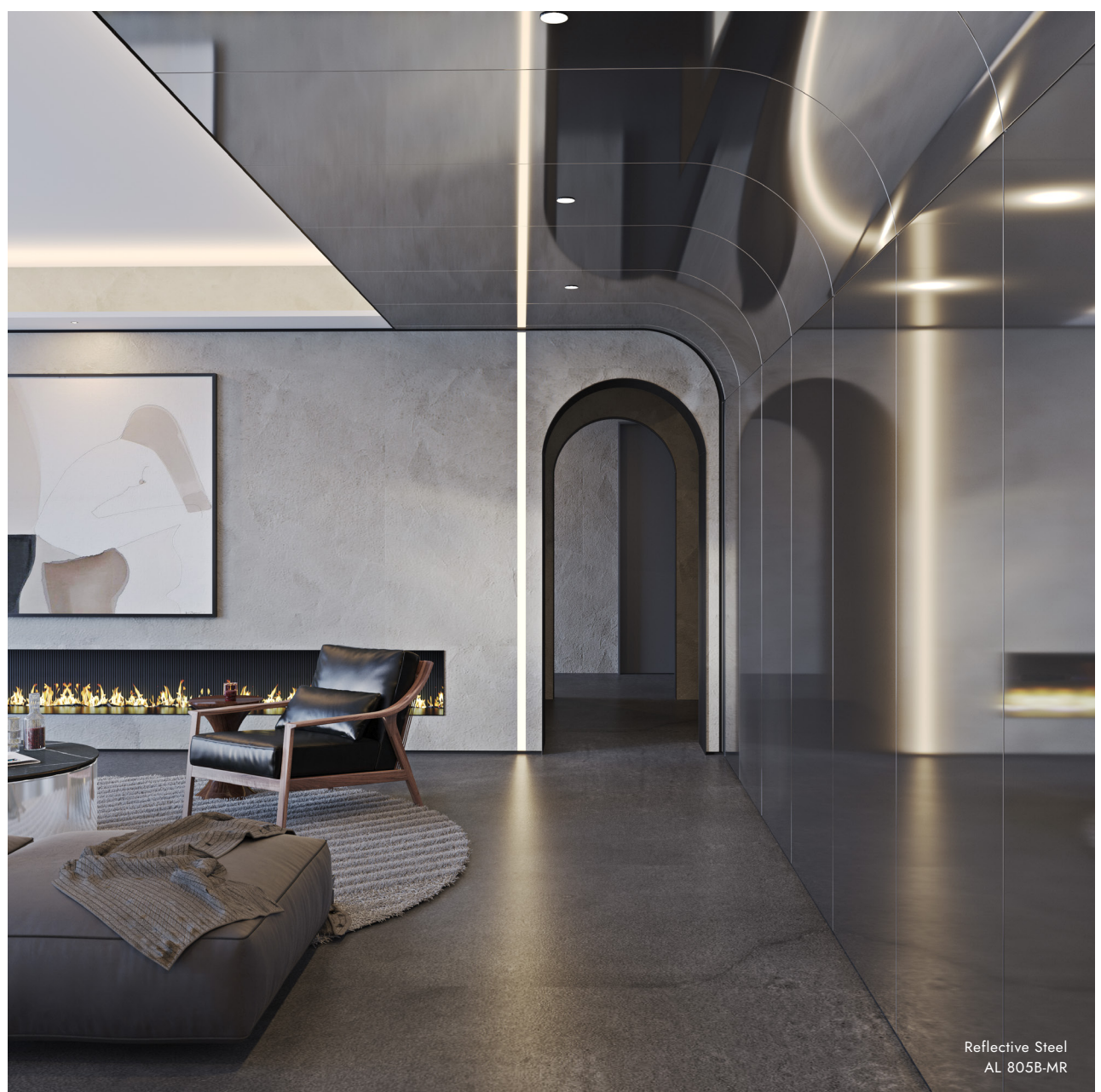
Reflective Steel AL 805B-MR