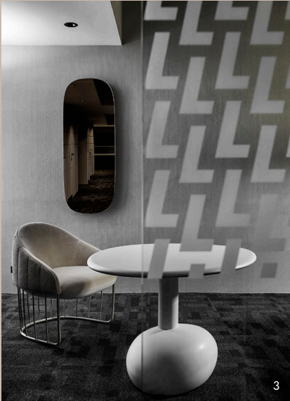
1,2,3 - Photos by: UPSTRS_